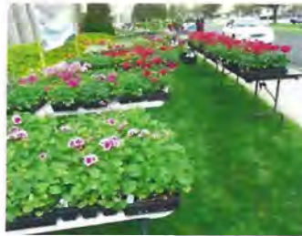
Geranium Sale – 2016

It is hard to believe but our geranium sale is less than one week away. The sale is in conjunction with Mother's Day weekend and runs from Friday May 12 to Saturday May 13 at Faith Lutheran Church on West Market Street in Akron. This sale is the primary means for us to fund two $1,000.00 scholarships to deserving students attending ATI in Wooster. I know that the college and the recipients are very thankful for our continued support as we saw as we met the recipients at our last meeting