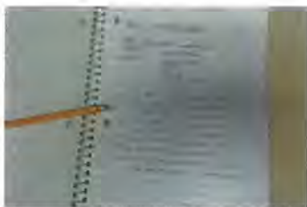
An example of a garden journal

In the words of their website, "Veggie U is dedicated to increasing children's awareness of healthy food options and teaching them how real food reaches their plate. We believe children who are exposed to growing their own food are more likely to include vegetables in their diet. Our national non-profit organization supplies Classroom Gardens and a standard based, five week science program to elementary and special needs students".